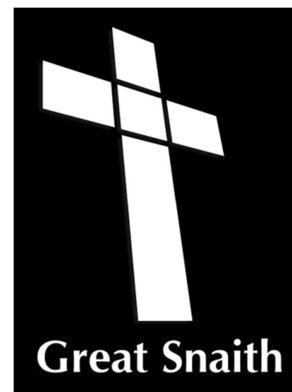
White logo without shadow